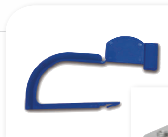
Tamper Evident Seal for Latch

Disposable Paper Filter | IMCO-FIL3M 100 pieces, blank, single use