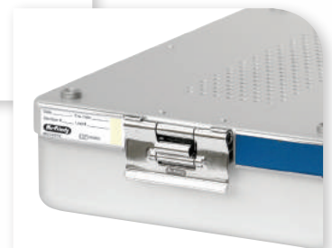
Container Indicator Card

Visit us online at Hu-Friedy.com/SterilizationContainers